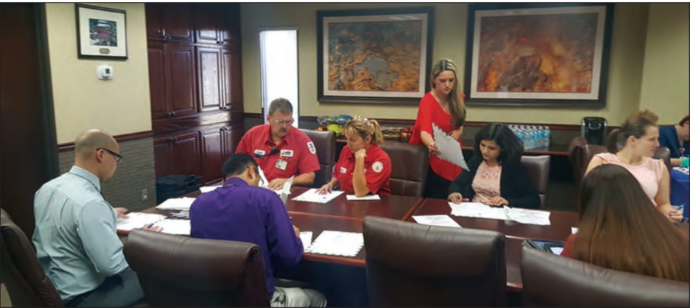
“Sign in and grab a Health Fair Passport.”

During the October 12th Health Fair, bananas apples and other fruit snacks were offered to the participants as they completed health risk assessment forms and proceeded to screening stations. The fair offered flu shots, lab work, biometric data and more. Good Shepherd Medical Center conducted the Health Fair for associates from Conduit Division locations and Duoline Technologies. The large conference room at the Conduit Division in Gilmer became a busy screening facility and everyone received Wellness Jackpot cards for their participation. Mammograms were available on November 2nd.