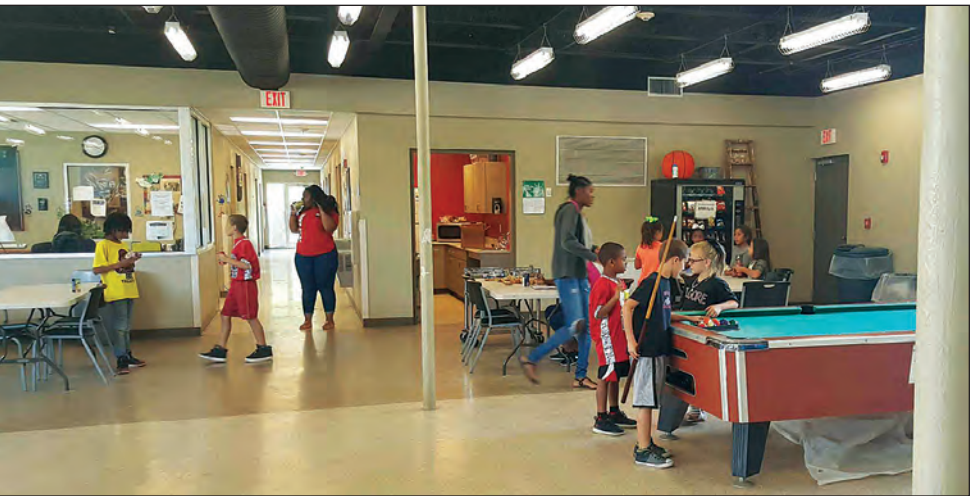
The Boys and Girls Club of America provides a wholesome environment for children to learn, grow and have fun.