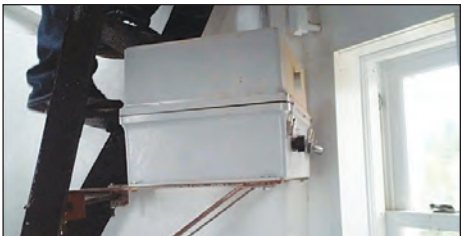
A Stahlin Non-Metallic FatBoy Series enclosure protects electrical components at the Crisp Point Lighthouse.

Stahlin's FatBoy series meets unique industry requirements for extra deep enclosures without significantly increasing the length and width of the enclosure. The FatBoy clamshell-styled enclosure provides equidistant capacity in both the cover and base. The series employs a flange mount base for ease of installation, a stainless steel full-length hinge and a stainless steel securing latch. Door clearance to the installed equipment must be considered, when specifying this enclosure. The demands for cover mounted components such as DIN facings or multiple contact pushbuttons are met with ample depth from the cover or with substantial height for panel mounted components.