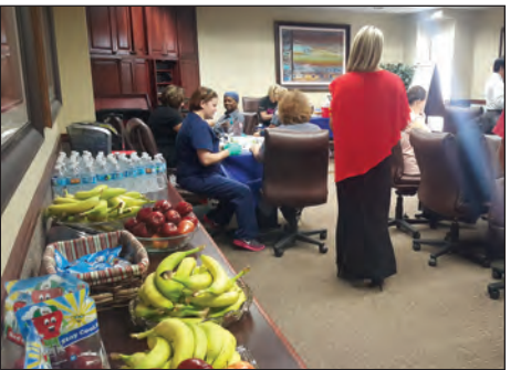
Healthy fruit snacks were served.

During the October 12th Health Fair, bananas apples and other fruit snacks were offered to the participants as they completed health risk assessment forms and proceeded to screening stations. The fair offered flu shots, lab work, biometric data and more. Good Shepherd Medical Center conducted the Health Fair for associates from Conduit Division locations and Duoline Technologies. The large conference room at the Conduit Division in Gilmer became a busy screening facility and everyone received Wellness Jackpot cards for their participation. Mammograms were available on November 2nd.