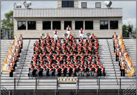
The Belding Redskins Marching Band

Beautiful weather and a great turnout punctuated the Belding Marching Band’s invitational on October 15th at Rudness Field in Belding. Over 1,000 students and 2,000 spectators watched as 13 bands competed for top honors at the event. The Redskins Band participated, but as host they were unable to compete.