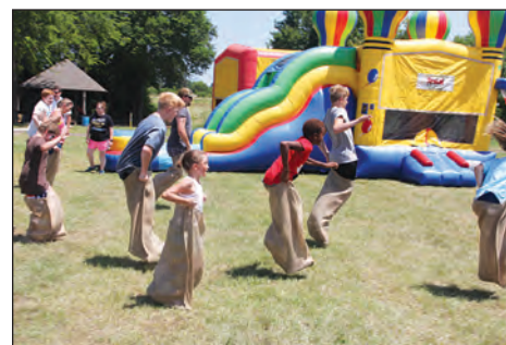
get set, GO!