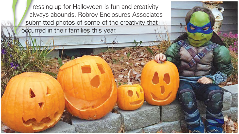
Dressing-up for Halloween is fun and creativity always abounds. Robroy Enclosures Associates submitted photos of some of the creativity that occurred in their families this year.