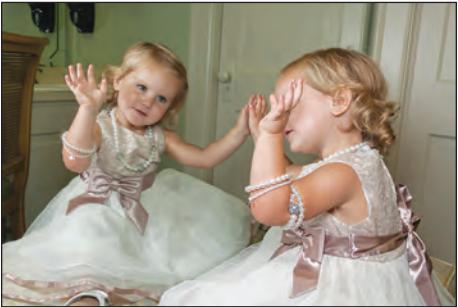
Ready for the big day.