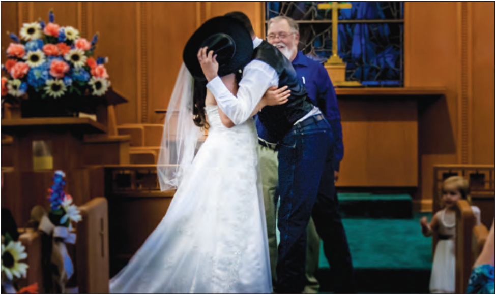
"You may kiss the bride!"