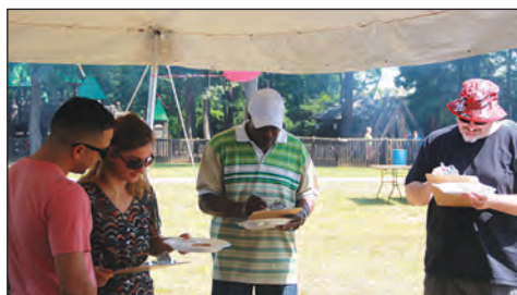
The Bake-off judges had a tough job, but ultimately came up with a winner.