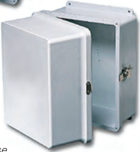
Below: Crisp Point Lighthouse