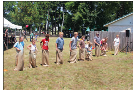
On your mark....