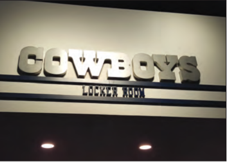
The Dallas Cowboys locker room was a stop on the tour of AT&T Stadium.