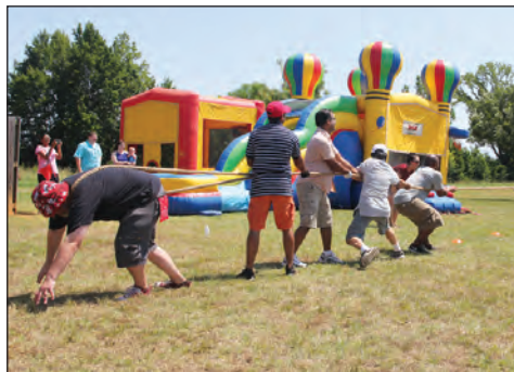
Men and women, boys and girls, everyone participated!