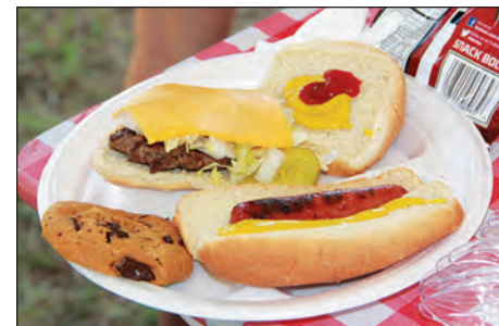
It's surely not a real picnic without burgers and hot dogs!