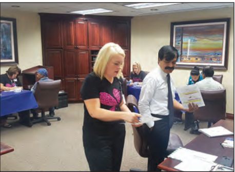
A lot of screening choices were made available.