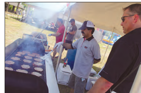
Management manned the grills.