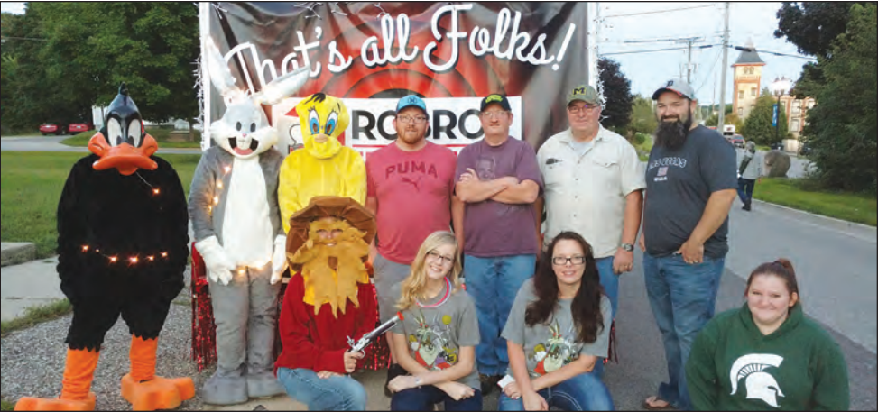
The Robroy Enclosures Parade Crew