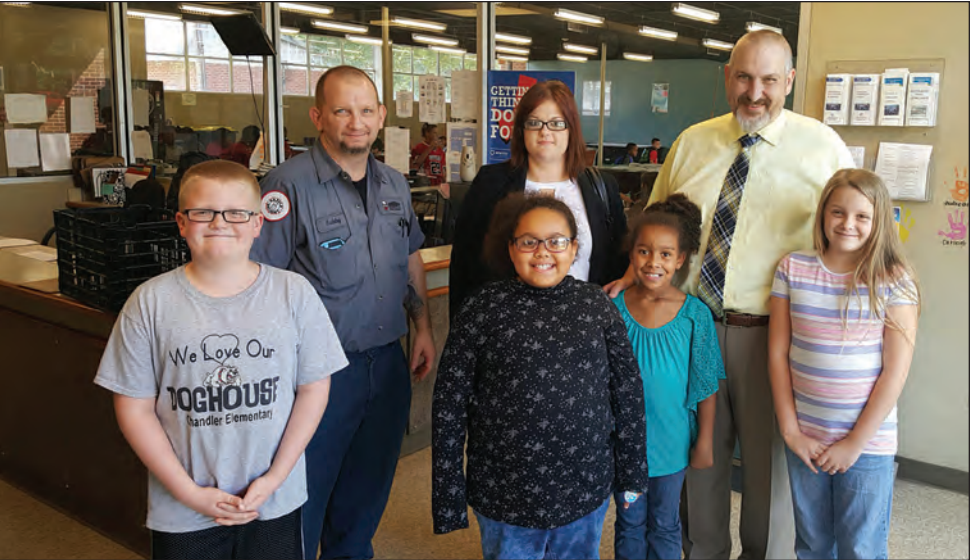
Conduit Division representatives presented their donation to the Boys and Girls Club of America.