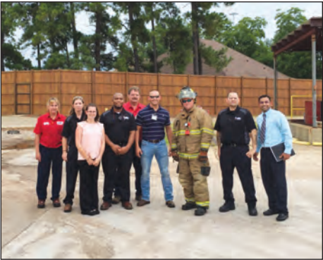
Employees gathered outside the plant in Gilmer to receive instruction on the proper use of a fire extinguisher.

It is hoped that a fire extinguisher will never need to be used at the Conduit Division or in the homes of their associates. However, if the need arises, Robroy Associates are well trained and ready for the task. Periodically, all Conduit Division Associates, both office and production personnel, receive fire extinguisher training. The training includes classroom and hands-on instruction in the proper use of equipment used to extinguish fires.