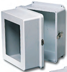
The Stahlin FatBoy Series

my toilet hanging a clock, the porcelain was wet, I slipped, hit my head on the edge of the sink. And when I came to I had a revelation, a picture, a picture in my head, a picture of this. This is what makes time travel possible. The flux capacitor," exclaimed Doc Brown. If it was not for that near-death experience and unexpected epiphany on November 5, 1955, Doc Brown would probably have never thought of the flux capacitor in the first place. Without the flux capacitor, there would be no time travel. Without time travel, there would be no Back to the Future . Quite a few people have paid tribute to the flux capacitor in one way or another. Therefore, Robroy Enclosures is paying tribute, as well. Without a Stahlin enclosure there would be no flux capacitor!