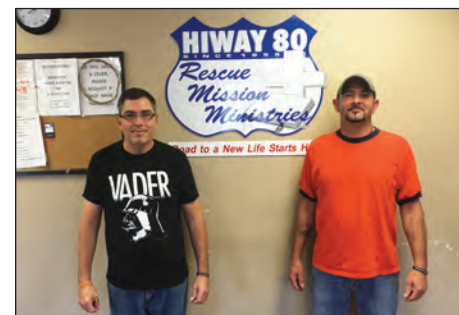
After the picnic all leftovers were taken to Hiway 80 Rescue Mission Ministries.

All of the leftover food was donated to Hiway 80 Rescue Mission Ministries. This organization provides meals to 120 people daily.