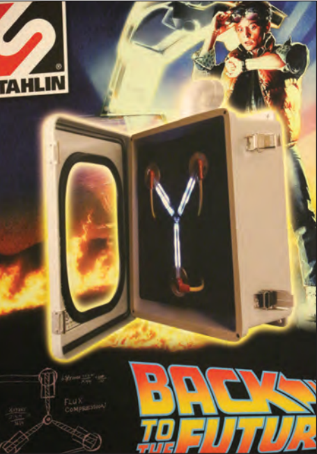
Yes, the Flux Capacitor was housed in a Stahlin enclosure.

Another important date that became part of the BTTF culture was November 5, 1955 — the date in time to which Marty McFly traveled at the beginning of the trilogy’s first film. That particular day in history held a special place in Doc Brown’s heart, because it was the day that he first thought of the flux capacitor being the key to time travel.