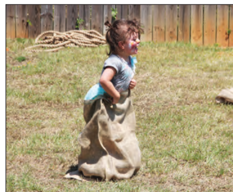
Hey! Wait for me!