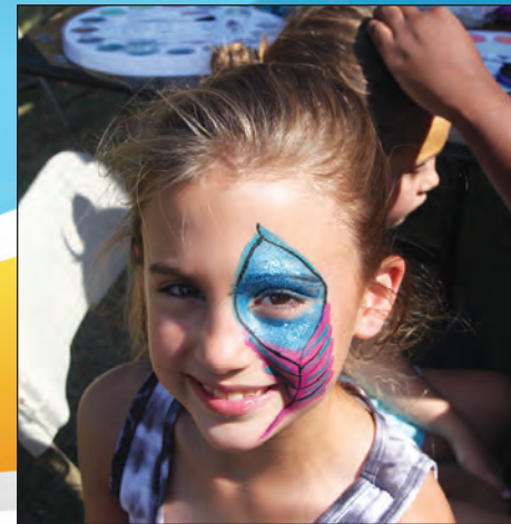
Face painting was a big "draw."