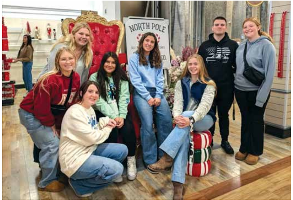
Members of Collective Impact