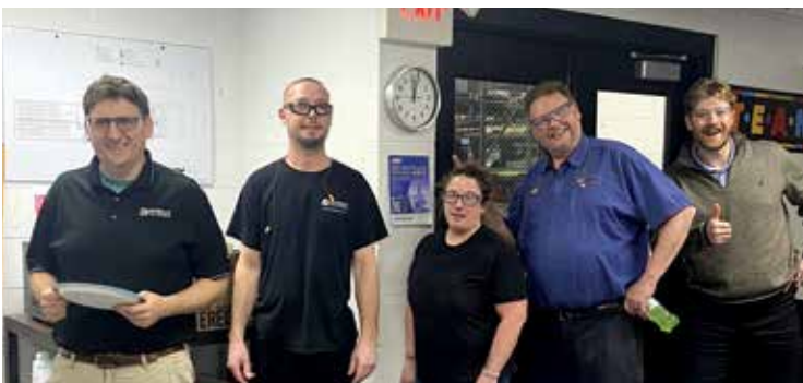
Some 1st Shift Associates ready for lunch.