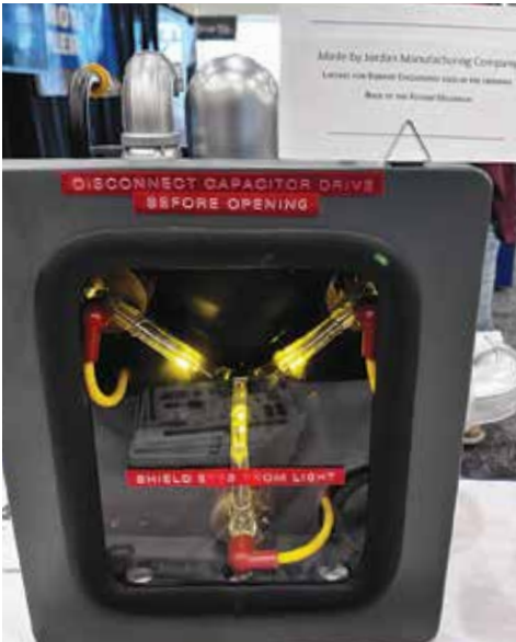
Flux Capacitor from Back to the Future

This year the show was held at Devos Place in Grand Rapids January 29th through February 1st. What significance did this have for Robroy Enclosures? The Flux Capacitor was displayed with the following description: "Made by Jordan Manufacturing Company Latches for Robroy Enclosures used in the original Back to the Future Delorean."