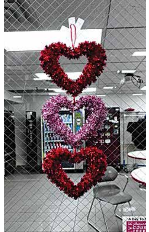
The breakroom was all "dolled-up" for Valentine's Day.