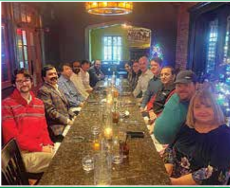
Hail, hail, the gang's all here!