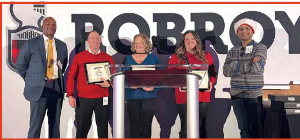
5 Year Service Award recognition.