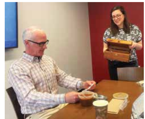
Associates randomly chose and read anonymous facts about one another.