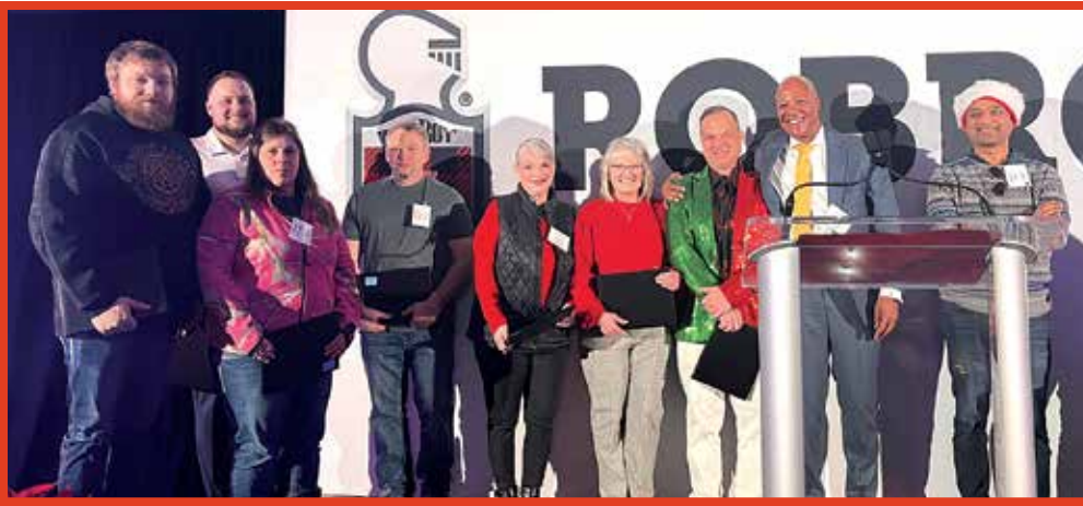
2 Year Service Award recognition.