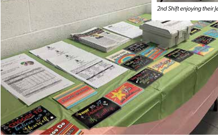
Cards were made available in the breakroom and could be dropped in a mailbox for delivery.