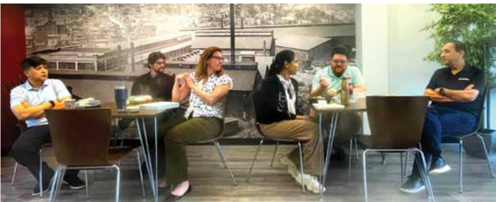
The breakroom was the venue for an interesting lunch.