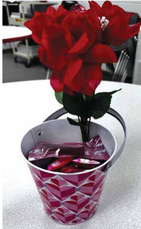
Flowers and candy.

All shifts were treated to pretty, pink cupcakes for Valentine's Day. In addition, centerpieces of flowers and candy were set on each breakroom table for everyone's enjoyment.