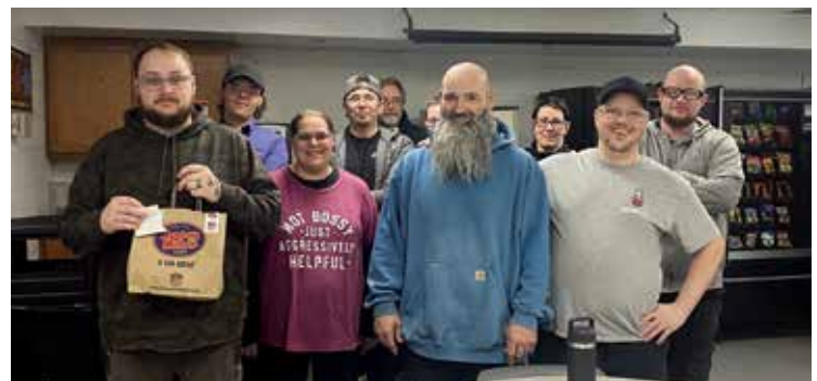
More 1st Shift Associates...