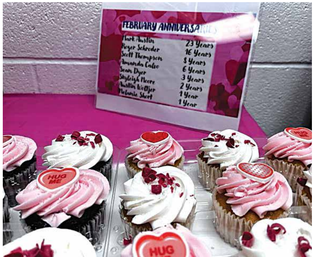
Cupcakes for all!