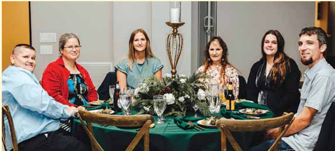
The first course is served – beautiful salad.