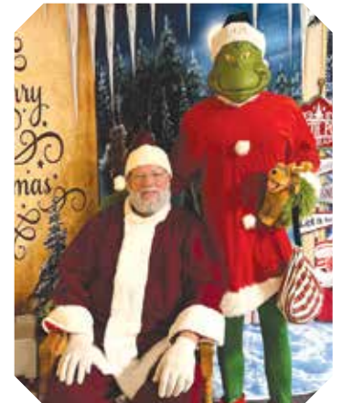
The main attractions at the party - Santa and the Grinch.