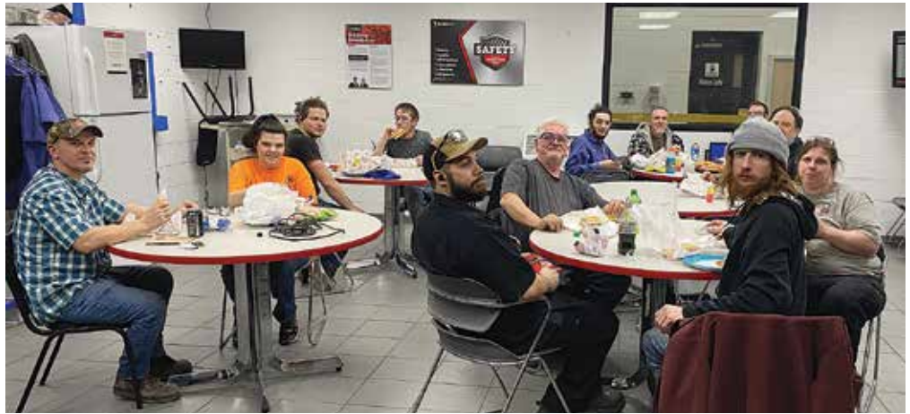
2nd Shift enjoying their Jersey Mike's lunch.