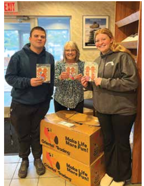
Robroy donated 565 Christmas Crafts to the Belding High School Collective Impact Group.

Robroy Enclosures Division has joined Collective Impact as a Vision Partner for the next three years. The continued support of the Belding community allows Collective Impact to expand resources and create meaningful programs that benefit not only Belding High School students, but the broader community as well.