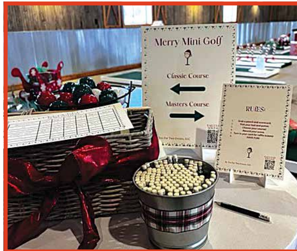
Merry Mini Golf with two courses.