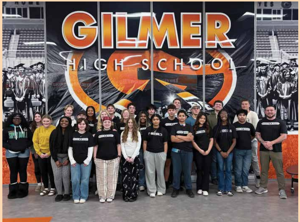
Gilmer High School Buckeye Media Program

The Raceway Division anticipates great things from the students' accomplishments with these tools and wish them continued success as their program grows.