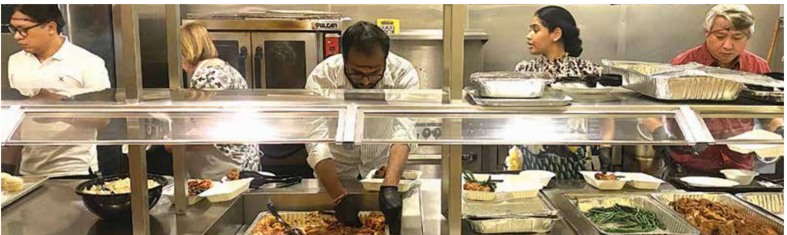
Many hands made light work and dinner was ready in no time.