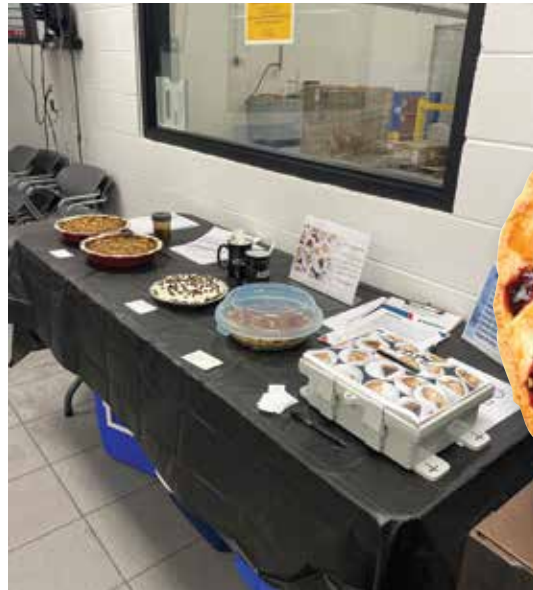
Each associate cast a vote for their favorite pie