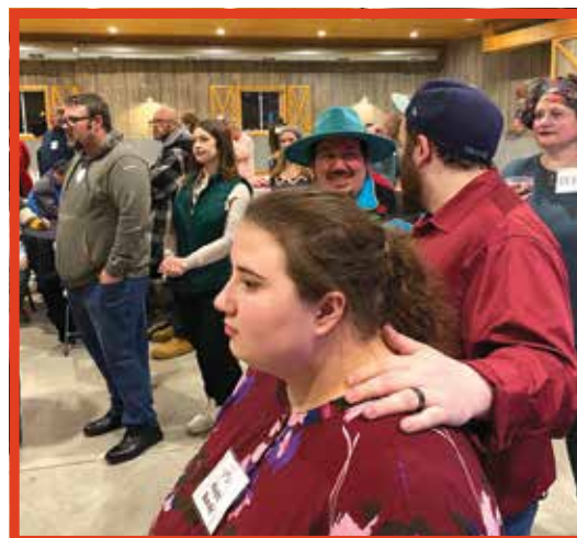
...anticipation of announcing of winners