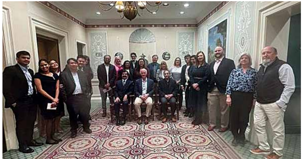
Headquarters Associates and their guests gathered to celebrate at the Annual Appreciation Dinner.