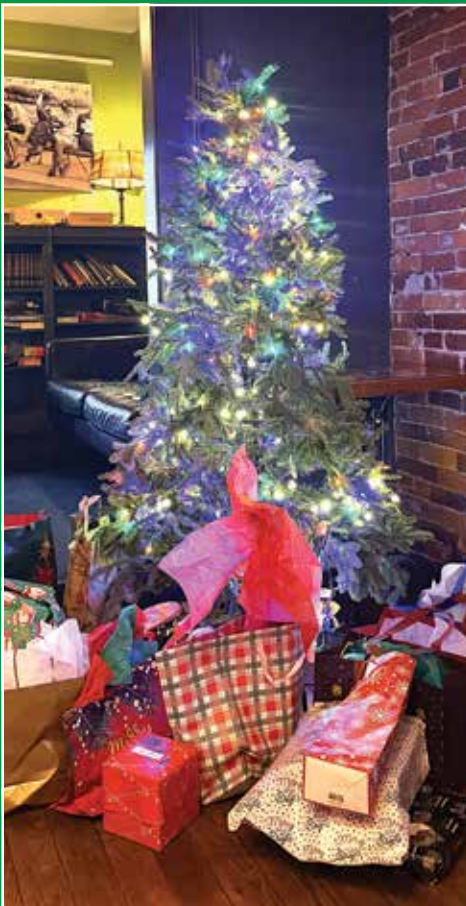
Secret Santa gifts for everyone under the Christmas Tree.

On a cool, cloudy, slightly damp (rather than snowy), warmer than the typical December 23rd afternoon, Headquarters Associates made the trip to the Abbey on Butler Street in Pittsburgh for an enjoyable Christmas lunch. The celebration also included a Secret Santa gift exchange.