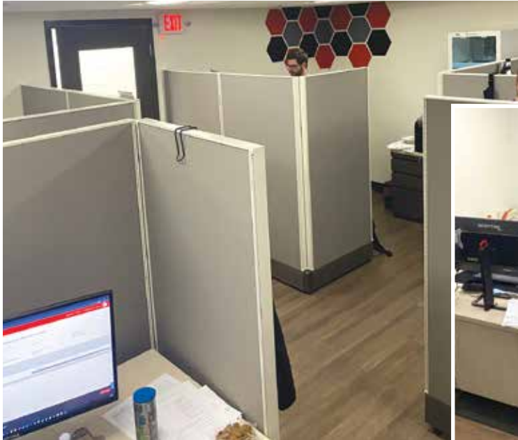
Associates enjoying their new workspace in the Engineering and Operations office.

By mid-January, construction was completed and the new office was unveiled and ready for use. The updated space now provides staff with an improved work setting, as reflected in the photos of team members settling into their new work areas.