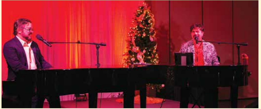
New York/New York Dueling Pianos provided the evening's entertainment.