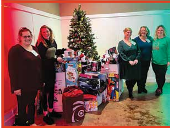
Look at all the great toy donations for Toys for Tots.