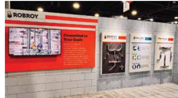
The Robroy booth at the IPPE Show