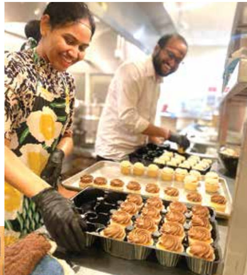
Associates enjoyed the camaraderie and meal preparation.