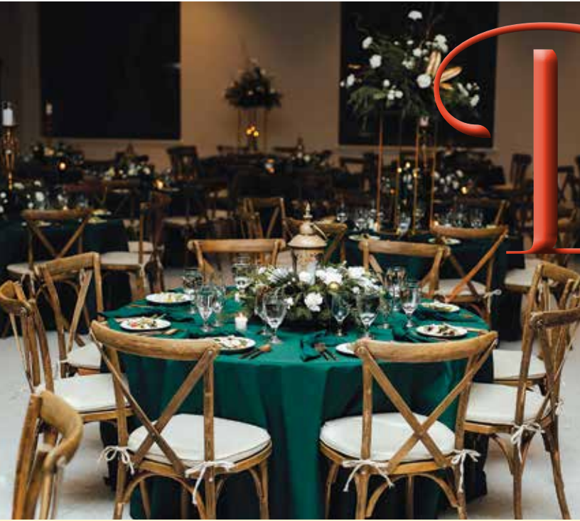
The Gilmer Civic Center was decorated beautifully for the holidays.

Doors opened on December 5th at the Gilmer Civic Center to welcome Robroy Raceway Division Associates for an evening of good food, award presentations and entertainment.