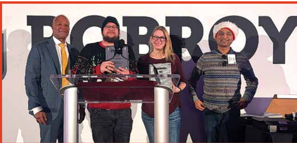
10 Year Service Award recognition.