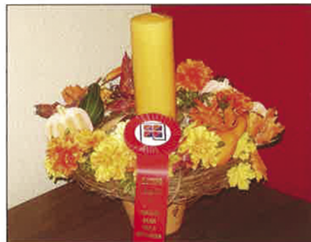
This centerpiece captures the essence of fall.

The annual Permian Basin Fair and Expo took place at the Ector County Coliseum in Odessa, Texas early in September. For the fourth consecutive year, Duoline Technologies