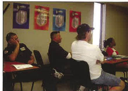
Duoline employees get some helpful information on budget/saving planning.

Recently, Duoline Technologies offered a Money Management Class to employees through a program called Citibank at Work. A Citibank representative came on-site to conduct this free financial education class. Thirteen participants took part in the first class, Basic Money Management. The presentation provided employees