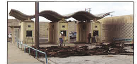
Stage One – Up comes the old asphalt.

The future home of Tidwell Park in Hobbs, New Mexico is in the preparation stages. This development is headed by MainStreet Hobbs, Inc. and Rice Operating Company donated time and equipment to help with this community project. On September 13th ROC removed the asphalt from this location for MainStreet.