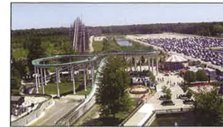
Michigan Adventure from the top of the Ferris Wheel.