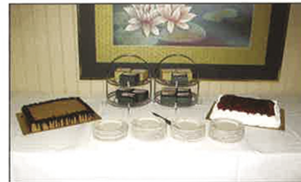
A choice of two? One of each of course!