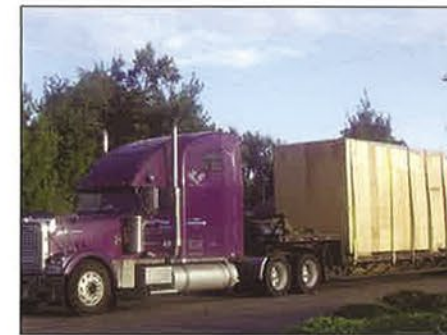
What is in that big box?