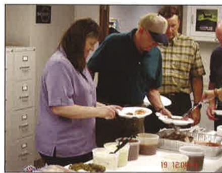
First place in line goes to the guest of honor.