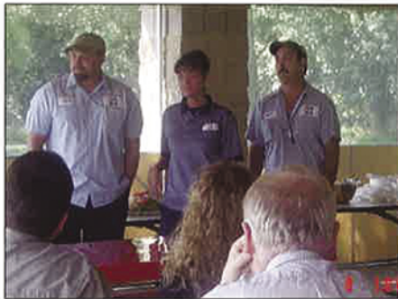
Well deserved recognition.

You may have heard that a phoenix can rise from its ashes. This refers to the mythological bird that sets himself on fire and a new phoenix rises from those ashes. Although the situations that are about to be described in this article never actually descend to ashes, you will see how conscientious employees rose to the occasion and circumvented what could have been potential problems. It is not often that the fruits of labor can be enjoyed, but two customers made that possible for three Stahlin employees.