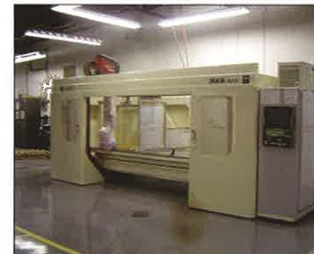
She is a beauty!

S tahlin acquired a new 5-axis CNC machine, the first of its kind at the Michigan facility. The 5-axis machine was purchased from Belotti SpA in Italy. Until September 1st Stahlin worked with two single axis CNC machines. The new Belotti machine expands Stahlin's capabilities to access all sides of an enclosures without repositioning it to produce the customer specified modifications. The acquisition of the Belotti machine significantly reduces fixturing costs, improves efficiencies, ensures higher quality expectations and it will alleviate capacity constraints. This is an exciting time for Stahlin and they look forward to expanding growth in the market place with the added ability to meet customer demands.