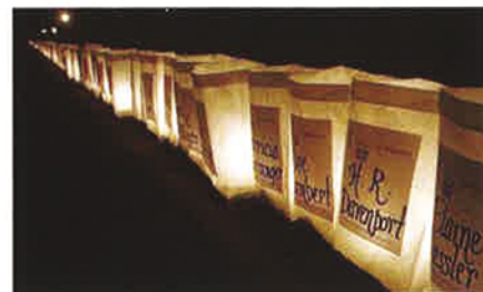
Luminaries glowed brightly on Saturday night for cancer survivors and victims.

In Hobbs, New Mexico, the 6th Annual Relay for Life was held on June 2nd and 3rd. Relay for Life is a fun-filled overnight event designed to celebrate survivorship and raise money for research and programs of the American Cancer Society. During the event, teams gather at schools, fairgrounds or parks and take turns walking or running laps. Each team tries to keep at least one team member on the track at all times.