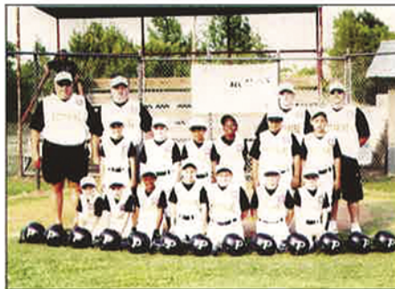
Pittsburg makes the playoffs.