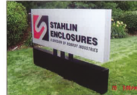
The new Stahlin sign was installed this summer.