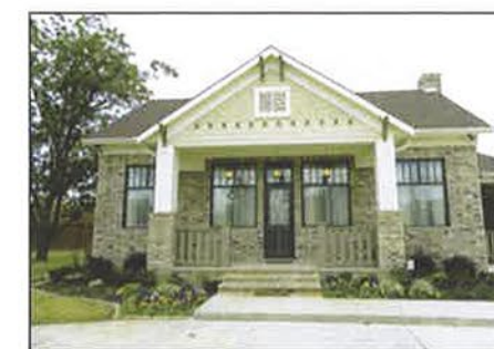
The grand front entrance welcomes visitors.

The following is a warning to visitors from other divisions. Plan a long visit if you are coming to the Conduit Division. Once you settle in at The Retreat you won't want to leave anytime soon!