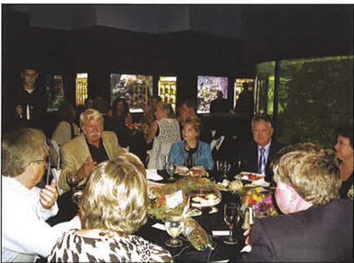
Laughter and interesting conversation filled the room at the "Houston Legends" event held for Hodges Southwest.