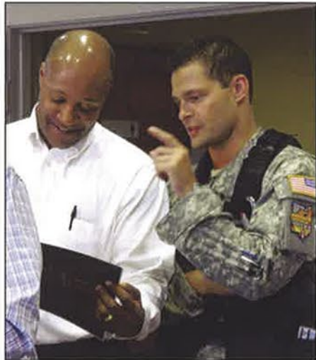
Members of the strategy session worked together in the team building exercises.