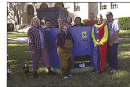
Sponge Bob assisted the associates to help entertain the attendees at their booth.