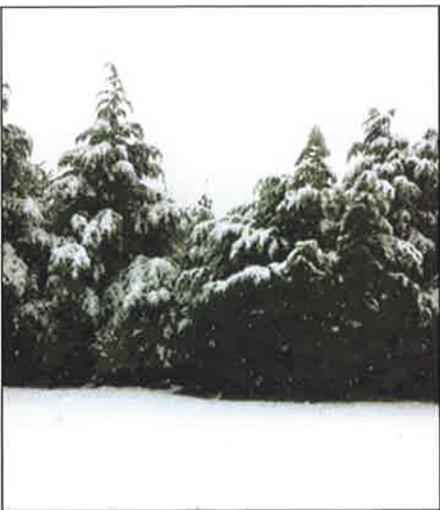
Pennsylvania in October

The photo that accompanies this article is a view outside the Deane family home depicting a freak October snowstorm that hit the Northeast on the Saturday before Halloween. The further north and east the storm traveled, the more