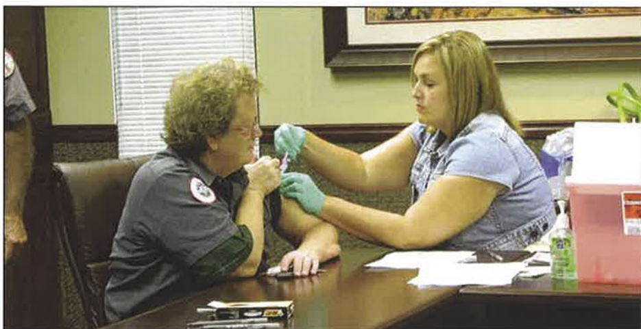
The Conference Room was converted into a clinic of sorts.

The Company provided flu shots again this year on October 31st, as a preventive measure to ward off the effects of influenza that is so prevalent in the winter months.