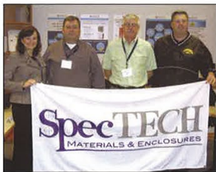
Stahlin Associates proudly display the SpecTECH banner.