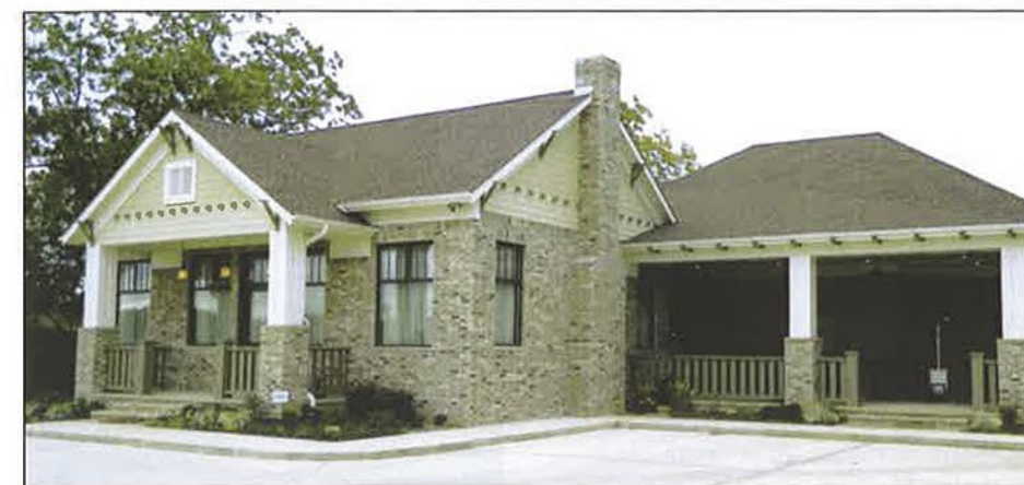
The Retreat has the look of a Mission style bungalow.