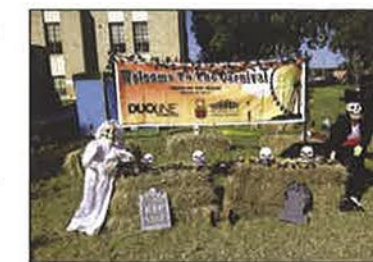
This display is enough to scare off the masses.