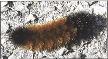
The Woolly Bear Caterpillar

Have you heard the folklore that you can predict the severity of the winter by observing Woolly Bear caterpillars? The following Web site tells you all about it http://www.almanac.com/content/predicting-winter-weather-woolly-bear-caterpillars . Legend has it that if the majority of the caterpillar's 15 segments are black – watch out – it will be a bad winter. There is no scientific evidence to prove that these fuzzy insects have a handle on forecasting the weather or knowing what the coming winter may have in store. However, is an early snowstorm in the Northeast any indication of what kind of winter is expected this year?