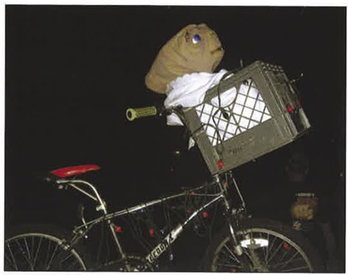
"ET phone home."