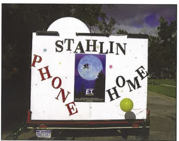
The rear view of Stahlin's 2nd Place float.

The 2011 Belding Labor Day Homecoming Parade theme was "Alien." Stahlin's interpretation of the theme took the form of two letters - ET. Their float was voted most creative in the Twilight Parade on Friday night, September 2nd and 2nd over all in the 106th Grand Parade on Monday. Stuffed ET's were given to the little kids on the float and all along the parade route 1,000 glow-in-the-dark Stahlin bracelets lit up the night. During the Grande Parade, Stahlin Associates passed out 4,000 Halloween size packages of Reese's Pieces; a huge hit with the crowd.