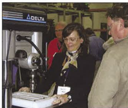
Hands-on-training is a part of the SpecTECH experience.