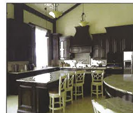
A spacious fully equipped kitchen sports beautiful granite counter tops.