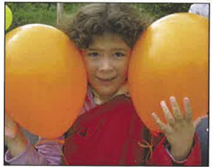
(Left) Chilly weather meant layers of clothes for the kids to keep warm.