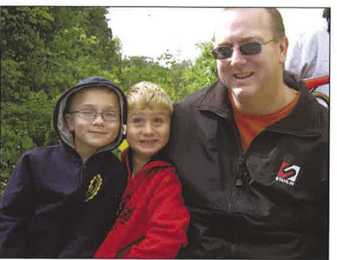
The dip in temperatures brought out the hoodies and jackets.