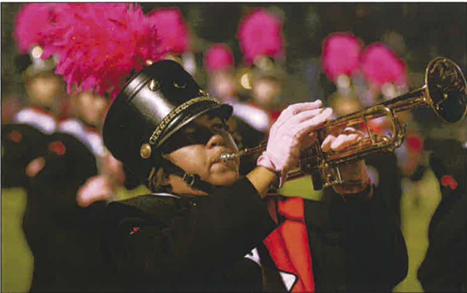
The pink gloves were donated by Stahlin Enclosures.