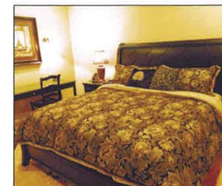
This is one of the eight private master suites.