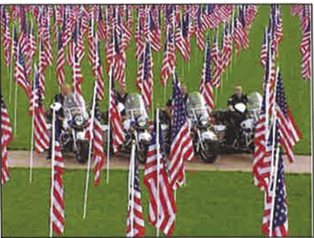
A snap shot of the Healing Field at Canonsburg Ski Area.

It began as a simple way for one person to visualize and comprehend the sheer enormity of human loss that occurred in the terrorist attacks of September 11, 2001. But, as hundreds of volunteers gathered to help, it soon became evident that something much more was emerging. It became a personal gesture of support, a tangible expression of mourning, and a very real healing experience. "Today, hundreds of Healing Field and Field of Honor displays are organized throughout the country for a variety of reasons, including tributes of honor, celebration, civic pride and education. Through these programs, communities come together, awareness is generated and funds are raised in support of worthy causes; but most importantly, individual hearts are healed." The Rockford Area Community Endowment (RACE) organized the Healing Field Memorial at the Canonsburg Ski Area in West Michigan. A display of 3,200 3' x 5' flags standing 8' tall and placed in perfect rows on the hills of the ski slope were displayed from September 9th through the 13th. The flags flew as a temporary patriotic tribute to the strength and unity of Americans and commemorated the 10th year since the tragedy of 9/11. Stahlin purchased flags in the names of Emelda Perry and Montgomery Hord. More information about Healing Field can be found at www.healingfield.org .